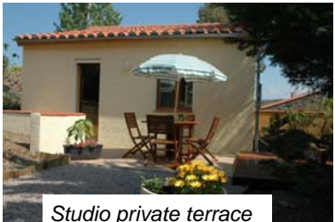
Studio private terrace

For those of you who would prefer a self catering apartment, our poolside studio is suitable for 2 people. The studio has a double bed,