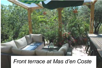
Front terrace at Mas d'en Coste

Our area is well served by Rail, Road or Air. A number of low cost airlines fly from European airports to Perpignan, Montpellier, Carcassonne and Girona, all of which are within easy reach of Mas d'En Coste.