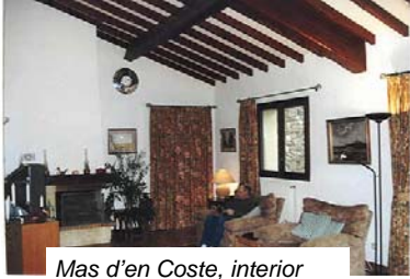
Mas d'en Coste, interior

Our Bed and Breakfast accommodation and studio apartment are situated in a tranquil area of southwest France, close to Perpignan.